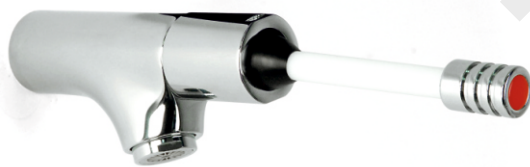
multi directional wall mounted tap (single) NC190CP

Available in standard and contemporary styles the push tap is safe, reliable and reflects the quality of the intatec range of total washroom solutions.