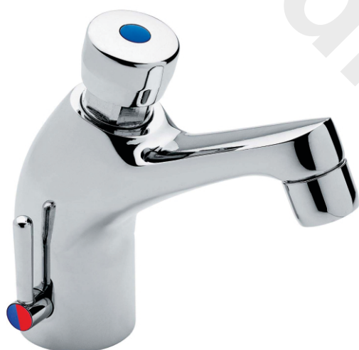
non concussive basin mounted tap adjustable temperature control NC180CP