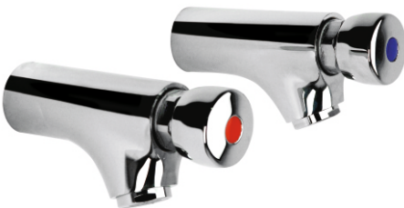
non concussive wall mounted tap (pairs) NC170CP