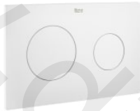
PL10 DUAL - Dual flush operating plate for concealed cistern with matt finishes