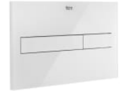
PL7 DUAL - Dual flush operating plate for concealed cistern