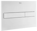
PL7 DUAL - Dual flush operating plate for concealed cistern