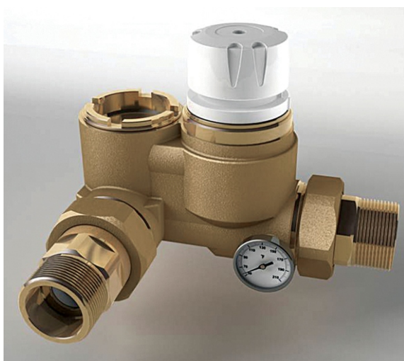
60013CP - thermostatic pressure balancing valve