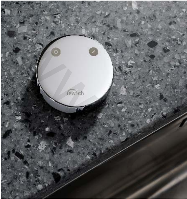
Swich Round Chrome: AT2050 (with GAC filter) AT2054 (with GAC and resin filter)