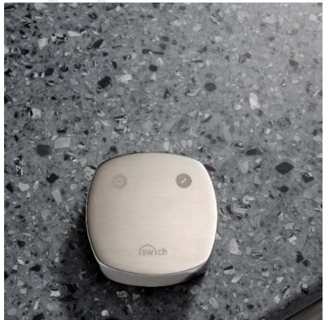
Swich Square Brushed Nickel: AT2053 (with GAC filter) AT2057 (with GAC and resin filter)