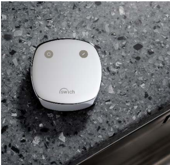
Swich Square Chrome: AT2052 (with GAC filter) AT2056 (with GAC and resin filter)