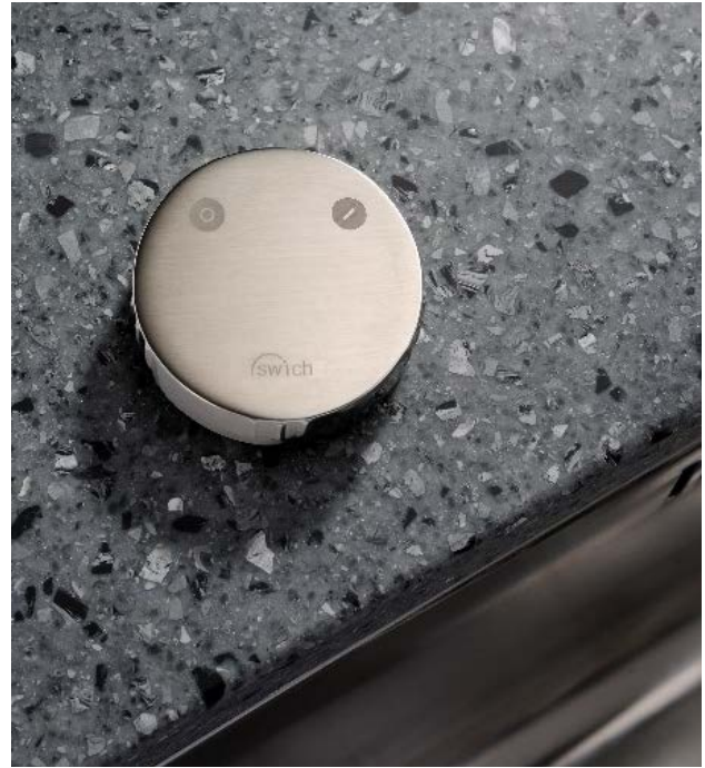
Swich Round Brushed Nickel: AT2051 (with GAC filter) AT2055 (with GAC and resin filter)