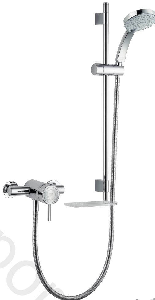
MIRA ELEMENT SLT EV

5 spray 11cm showerhead with rub-clean nozzles (except BIR which has one single spray)