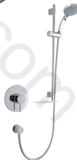
MIRA ELEMENT SLT BIV